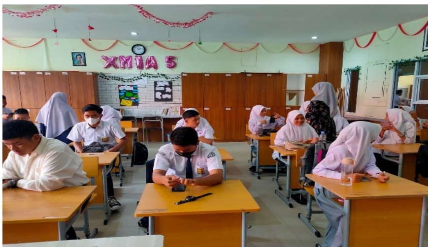
Figure 3. Implementation Application in Class